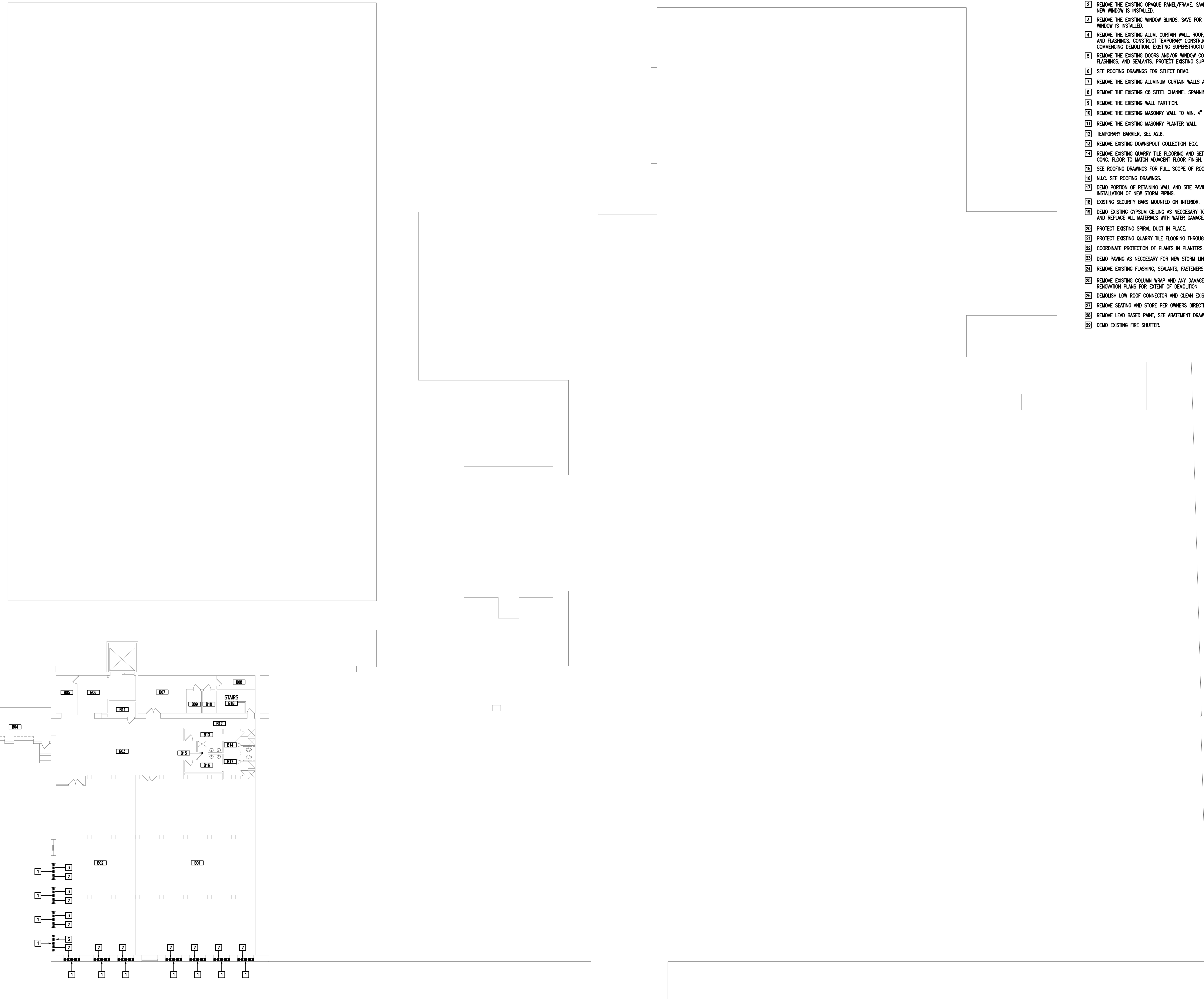
1 BASEMENT FLOOR DEMOLITION PLAN SCALE: 1/16" = 1'-0"